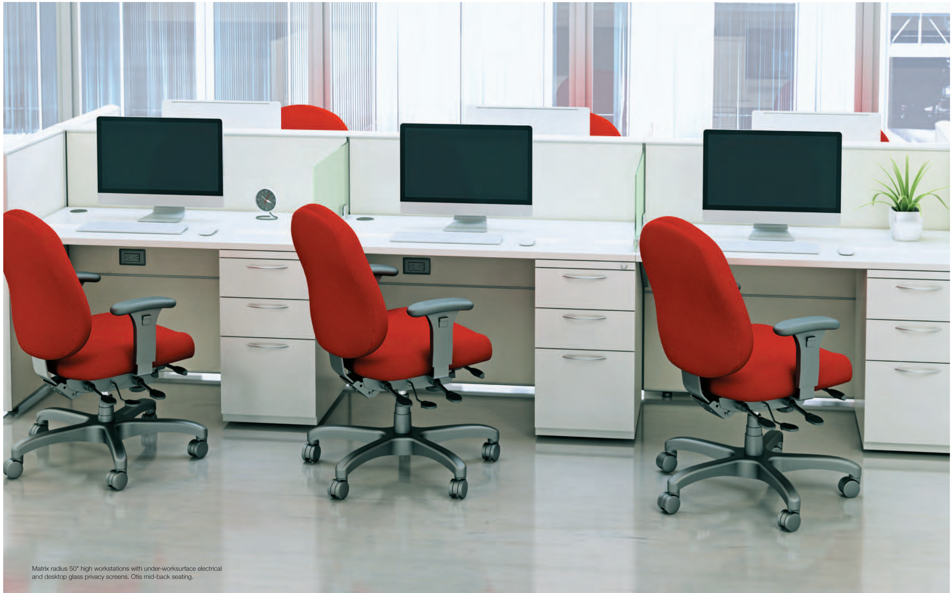
Matrix radius 50" high workstations with under-worksurface electrical and desktop glass privacy screens. Otis mid-back seating.