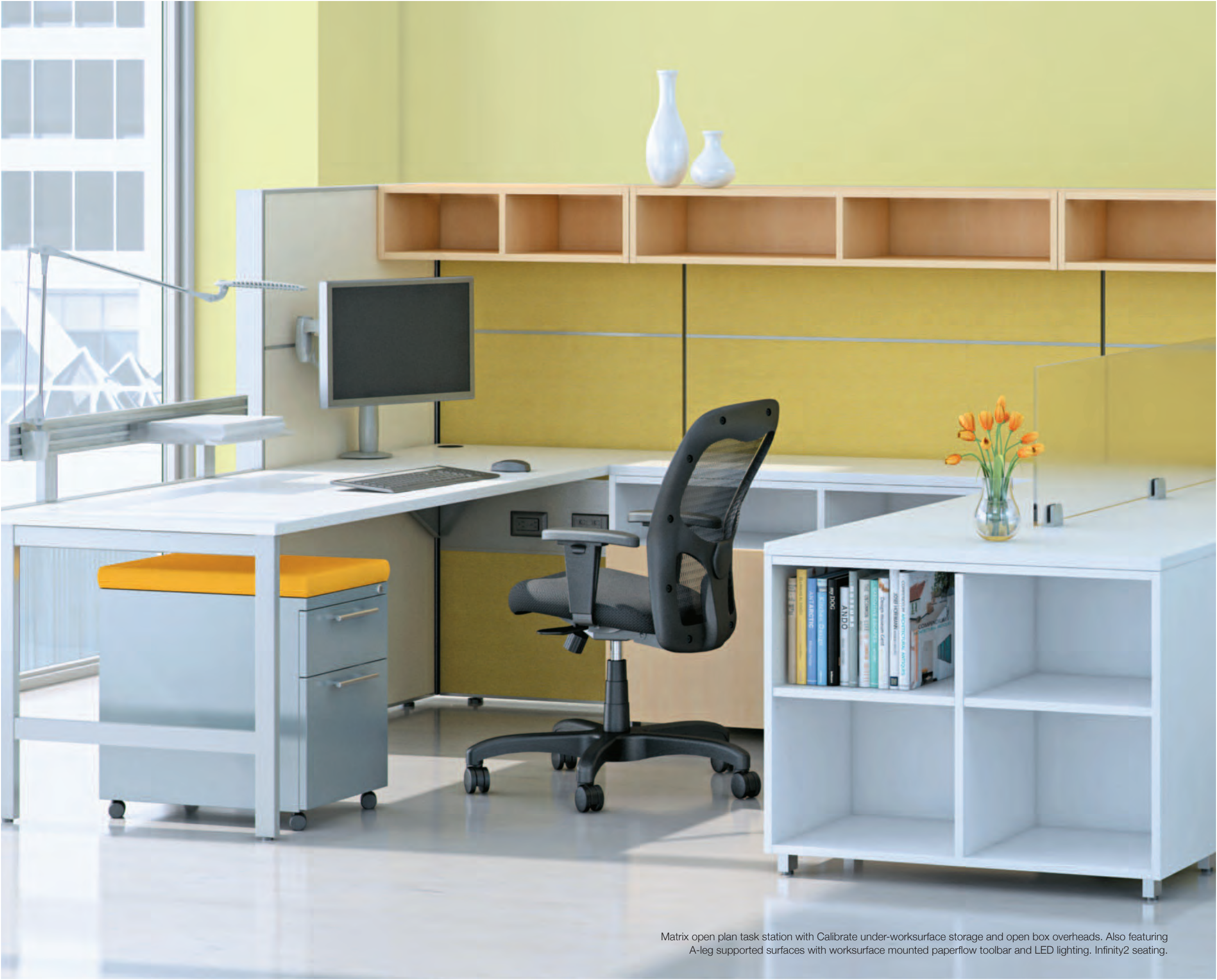
Matrix open plan task station with Calibrate under-worksurface storage and open box overheads. Also featuring A-leg supported surfaces with worksurface mounted paperflow toolbar and LED lighting. Infinity2 seating.

When coupled with Calibrate components and accessories, work areas become collaborative and modern with a twist of elegance. With virtually limitless options, Matrix can bring your office space to a new level of sophistication.