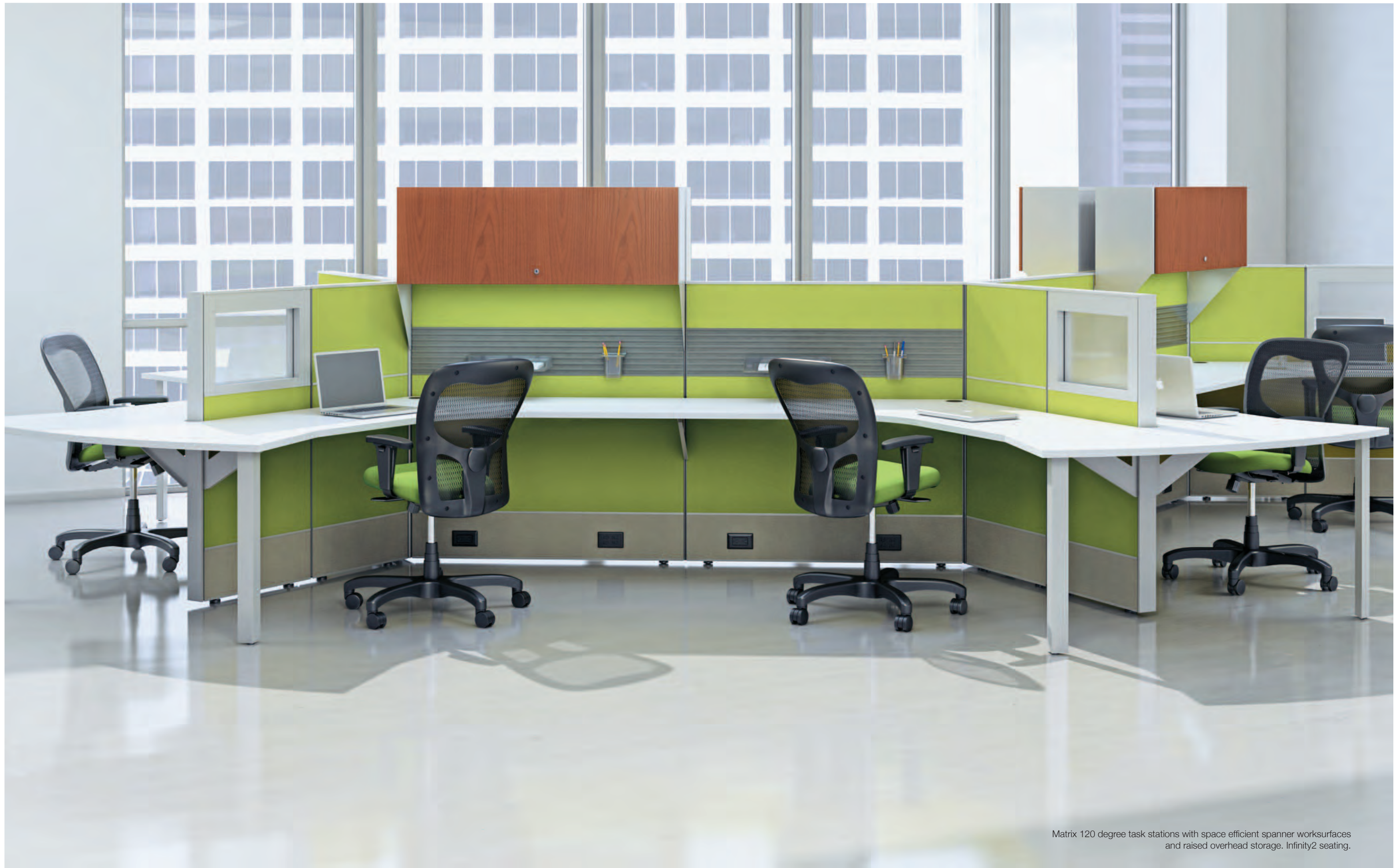
Matrix 120 degree task stations with space efficient spanner worksurfaces and raised overhead storage. Infinity2 seating.