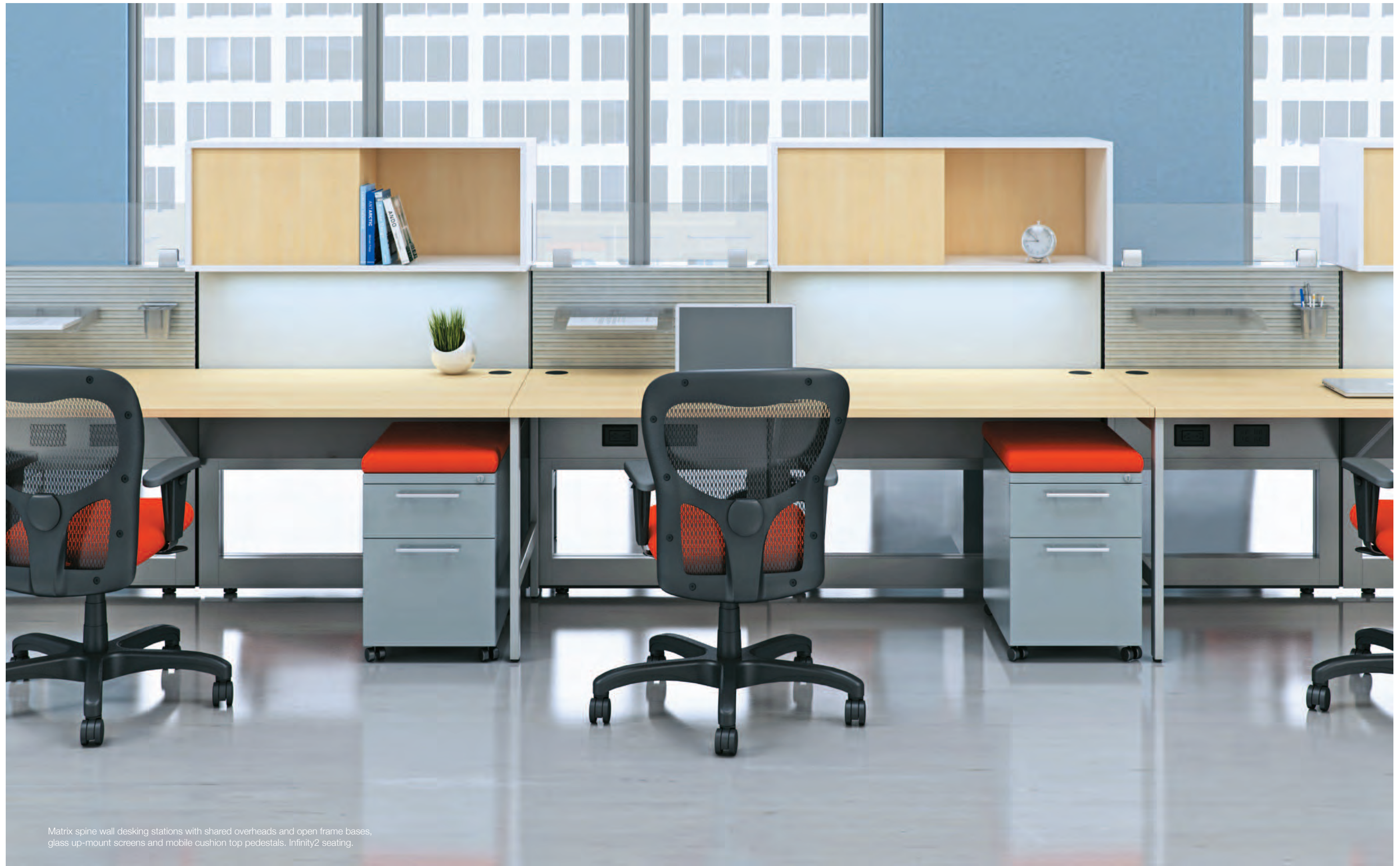
Matrix spine wall desking stations with shared overheads and open frame bases, glass up-mount screens and mobile cushion top pedestals. Infinity2 seating.