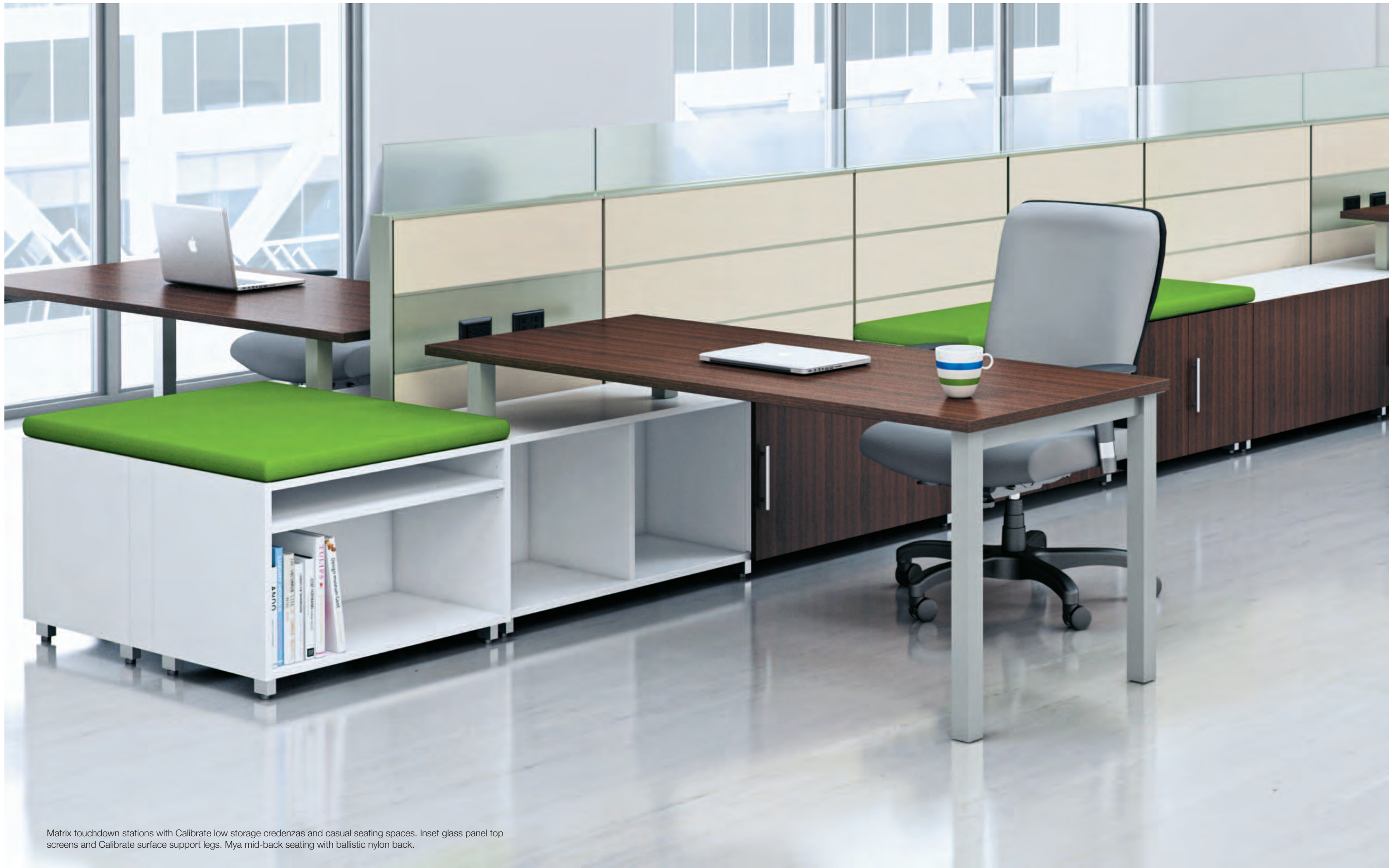
Matrix touchdown stations with Calibrate low storage credenzas and casual seating spaces. Inset glass panel top screens and Calibrate surface support legs. Mya mid-back seating with ballistic nylon back.