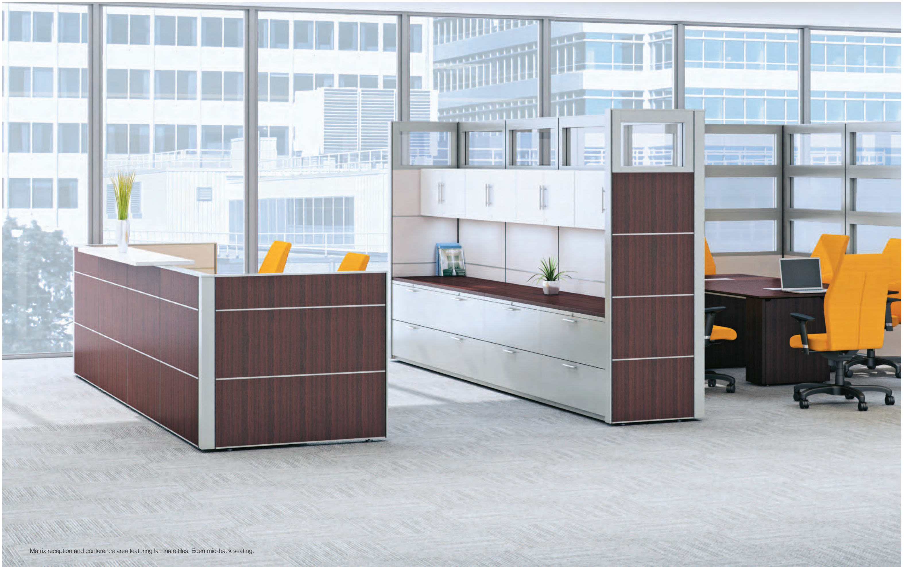
Matrix reception and conference area featuring laminate tiles. Eden mid-back seating.