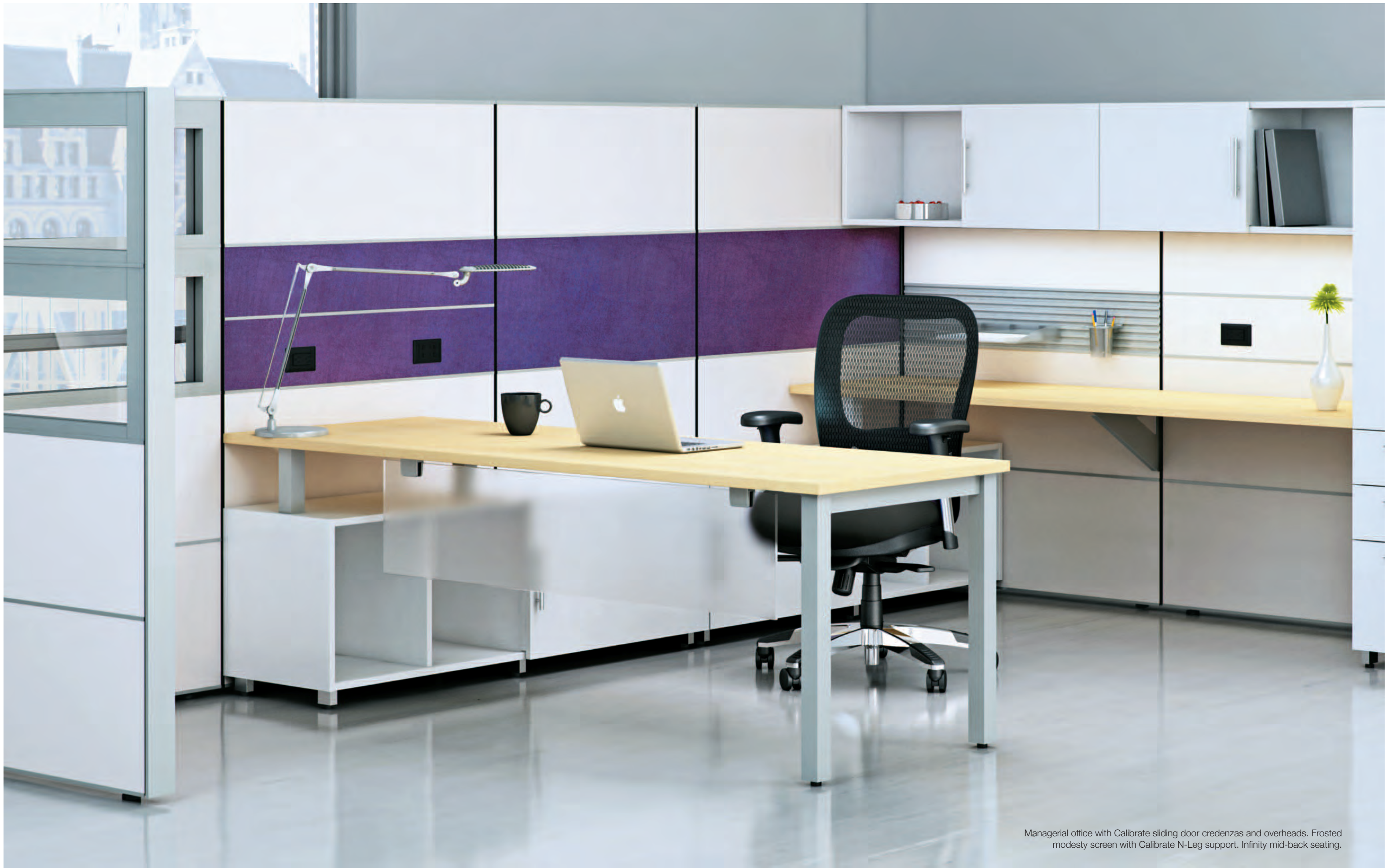
Managerial office with Calibrate sliding door credenzas and overheads. Frosted modesty screen with Calibrate N-Leg support. Infinity mid-back seating.