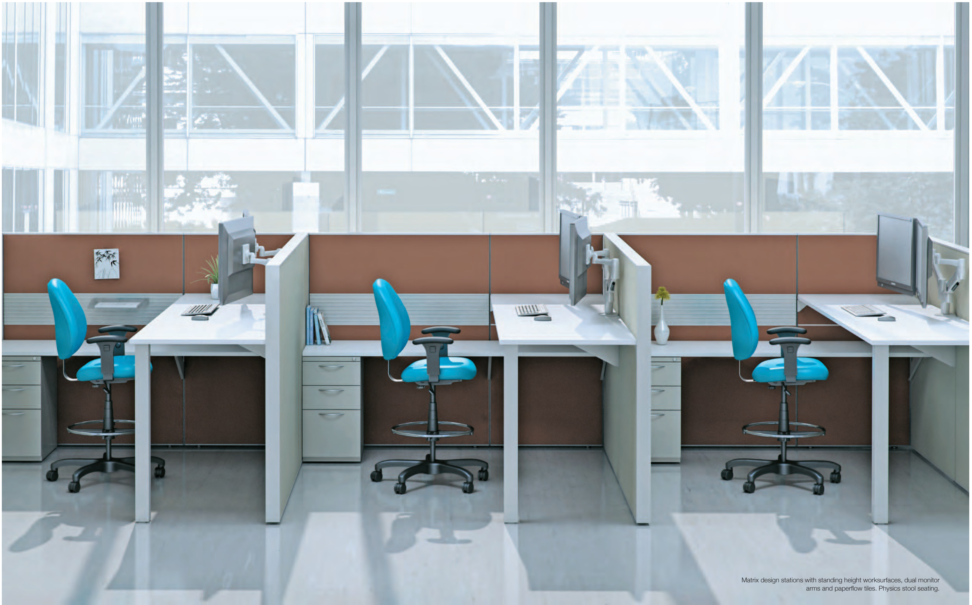
Matrix design stations with standing height worksurfaces, dual monitor arms and paperflow tiles. Physics stool seating.