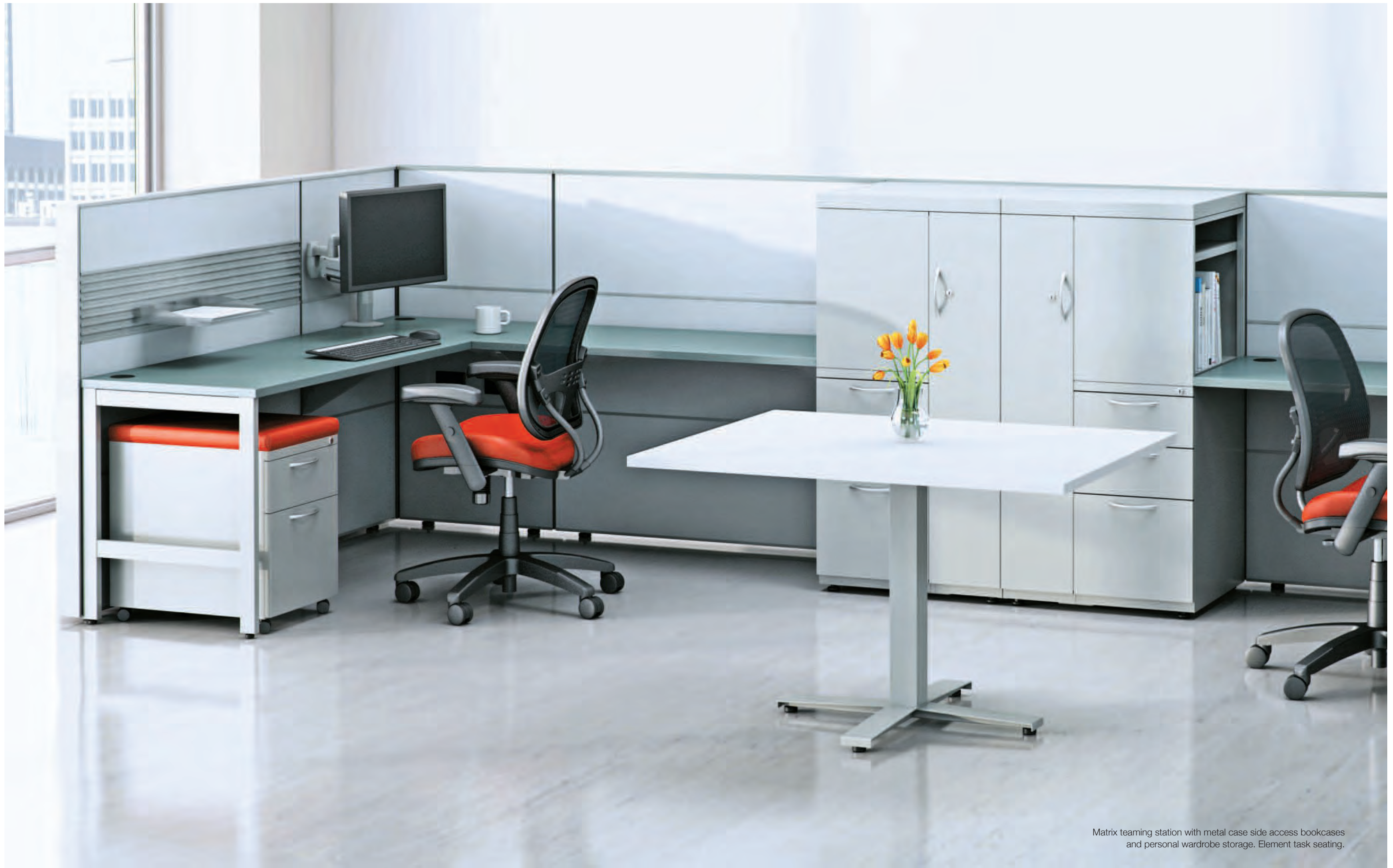
Matrix teaming station with metal case side access bookcases and personal wardrobe storage. Element task seating.