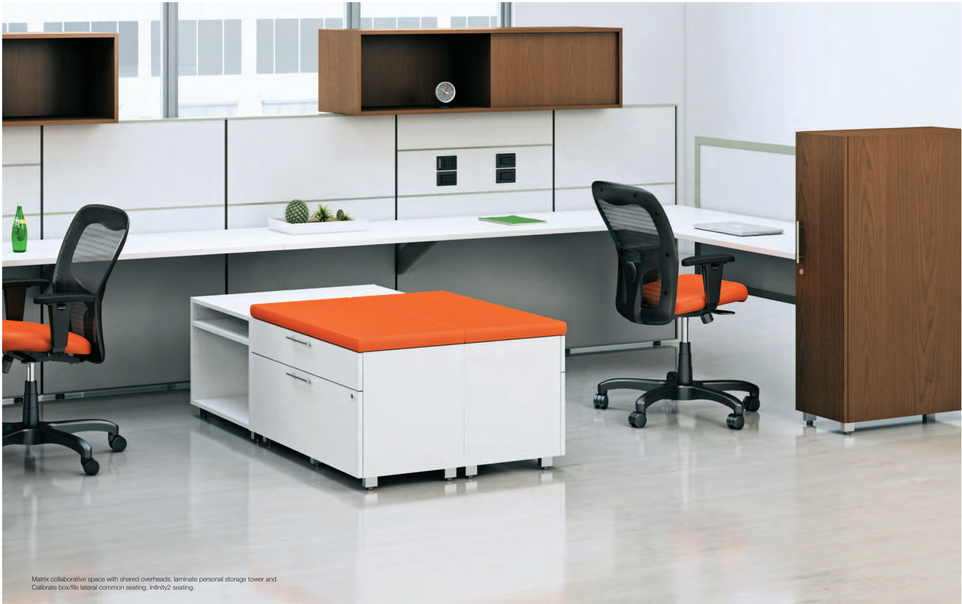
Matrix collaborative space with shared overheads, laminate personal storage tower and Calibrate box/file lateral common seating. Infinity2 seating.