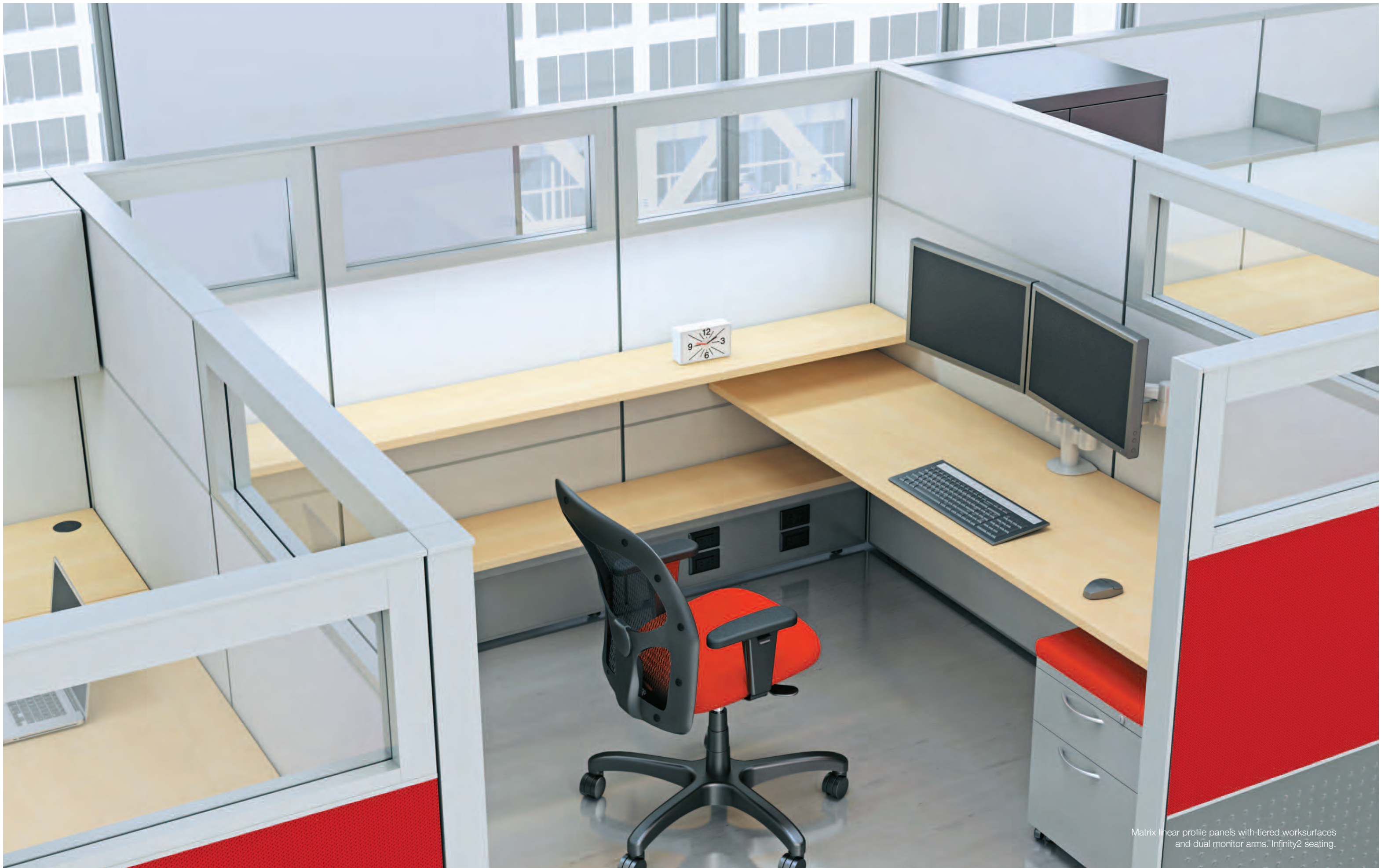
Matrix linear profile panels with tiered worksurfaces and dual monitor arms. Infinity2 seating.